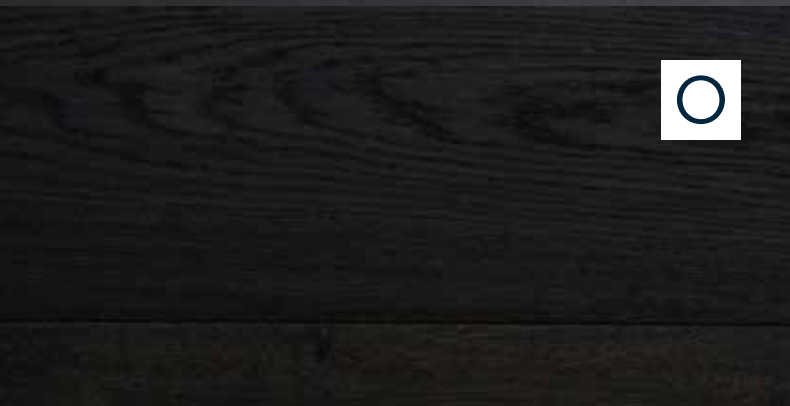
Narva - OS-1006 Handscraped surface