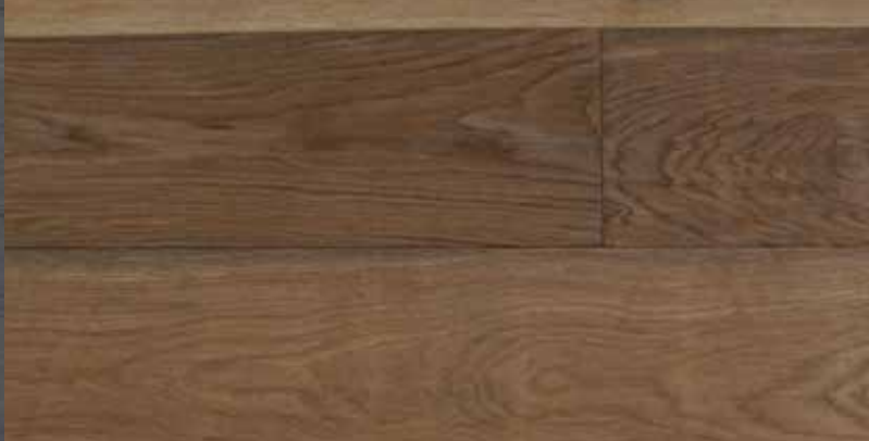
Gdynia - OS-1004 Handscraped surface