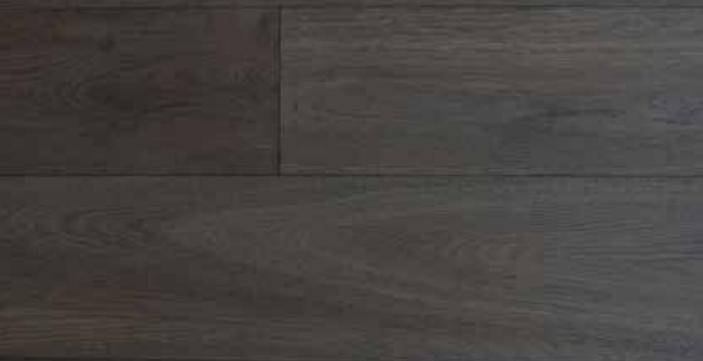
Grey Wash - OS-1005 Brushed surface