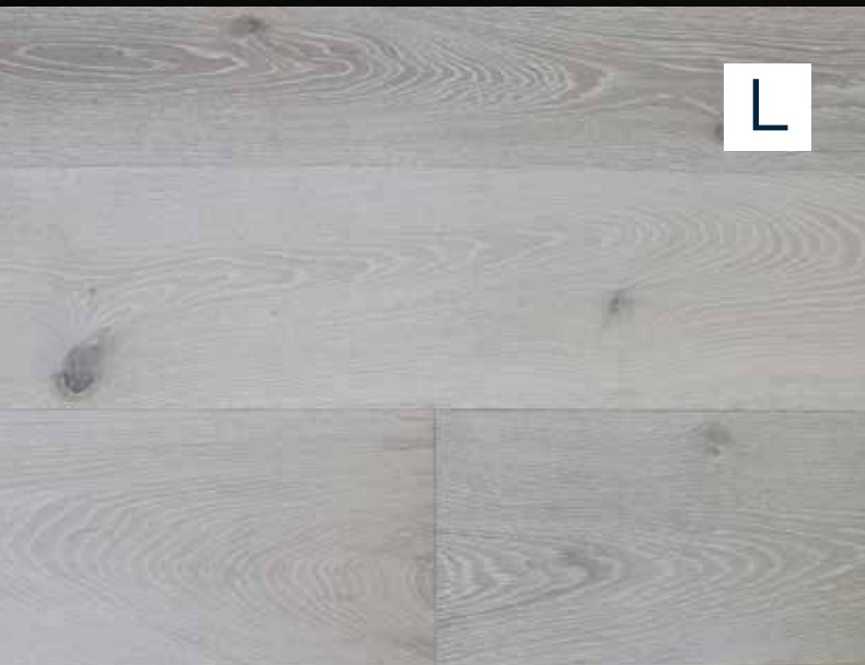
Natural Limed - OS-1002 Brushed surface