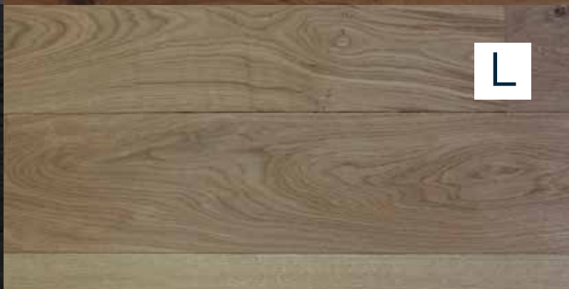
French Natural - OS-1001 Smooth surface